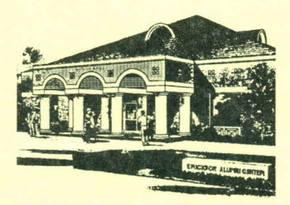
(Proposed) Erickson Alumni Center