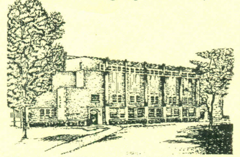
Fleming Hall, home of the Yellow Jackets