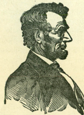
ABRAHAM LINCOLN Born February 12, 1809. Died April 15, 1865.