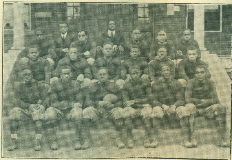
THE WEST VIRGINIA COLLEGIATE INSTITUTE FOOTBALL TEAM of 1916