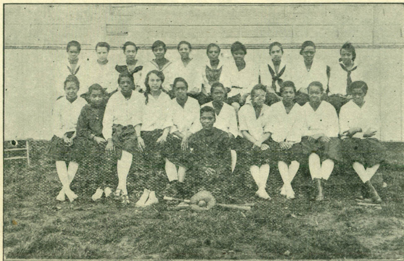
GIRLS BASE BALL TEAM