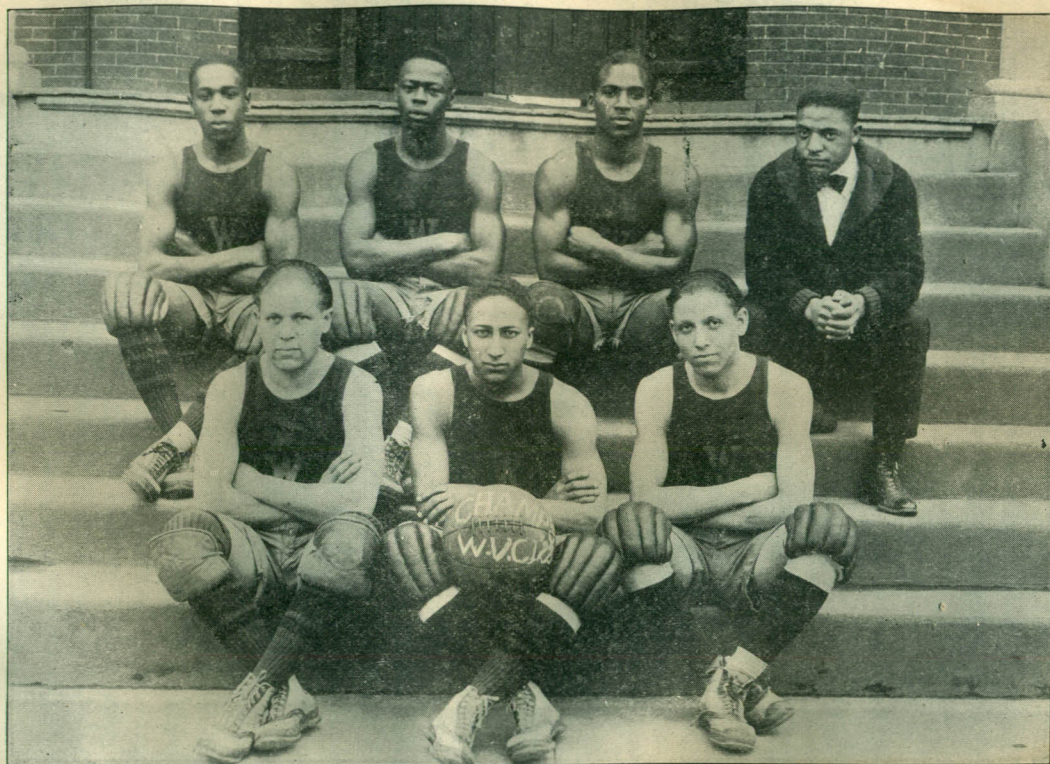
FOURTH-YEAR CLASS BASKETBALL CHAMPIONS—1922