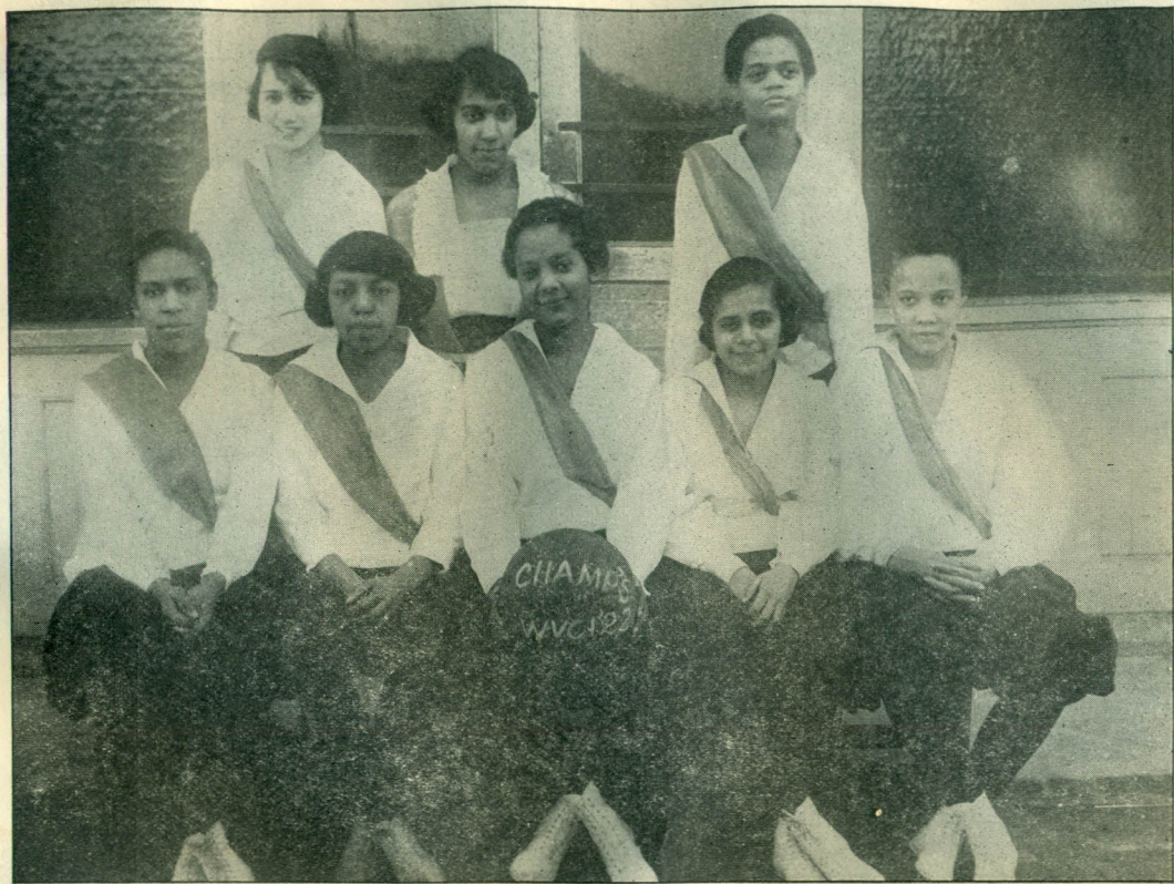
THE INTER-CLASS GIRLS' CHAMPION BASKETBALL TEAM (MOUNTAINEERS)—1922