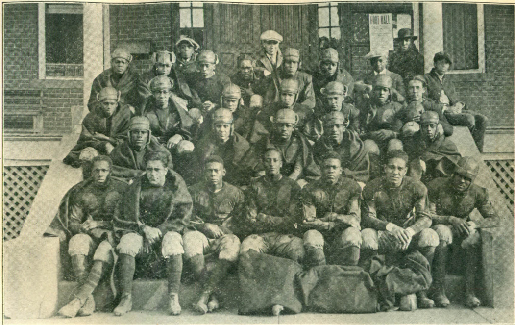
FOOTBALL SQUAD 1923